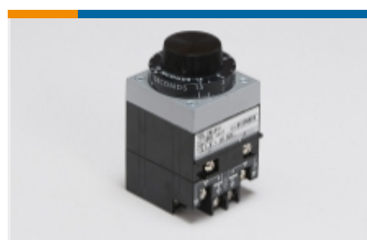
Time Delay Relays(176)